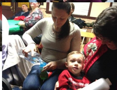
And what is he bringing to me..?