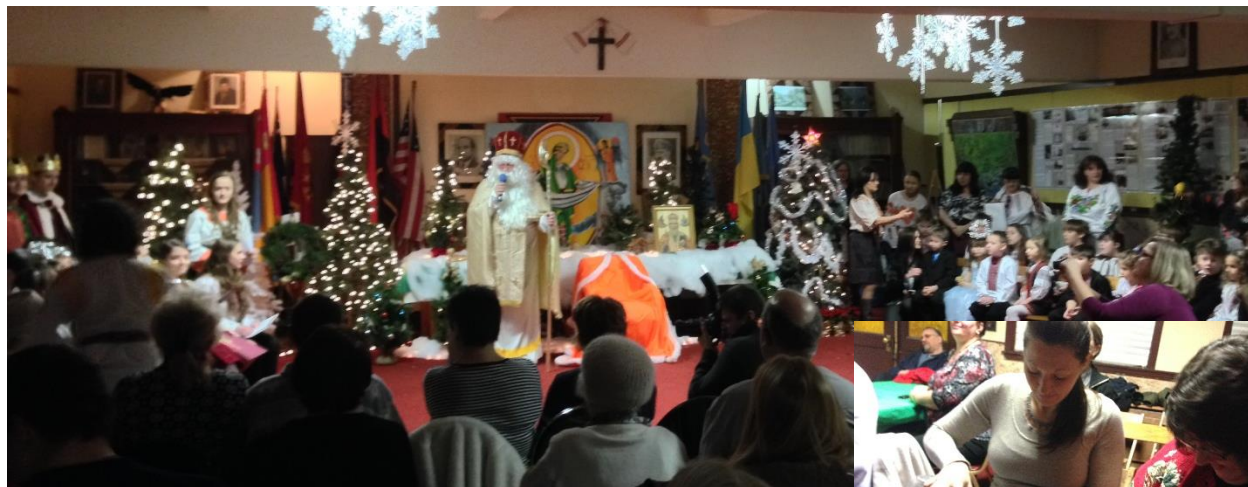
On top right: Пластова Свічкака Plast. Program for Christmas, January 5, 2014 Bottom: Св. Миколай у Рідній Школі St. Nicholas visit, Ridna Shkola, Dec 21, 2013