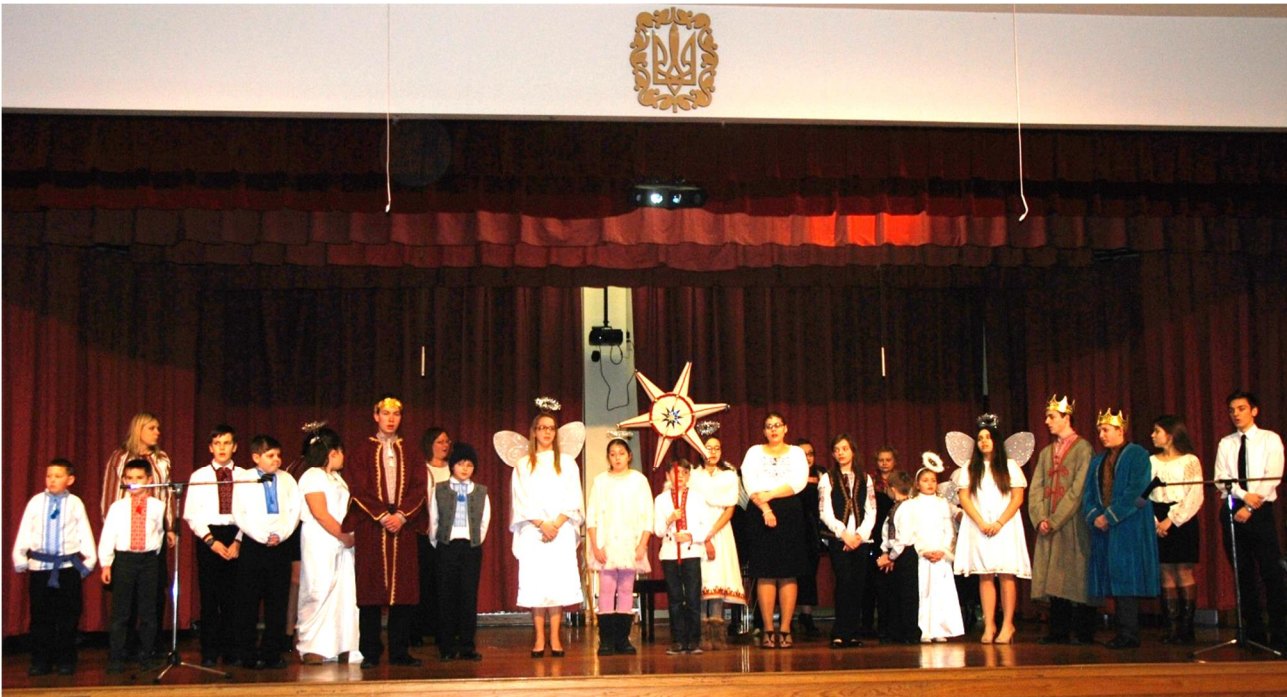
Ridna Shkola – Christmas Play at St. John Parish