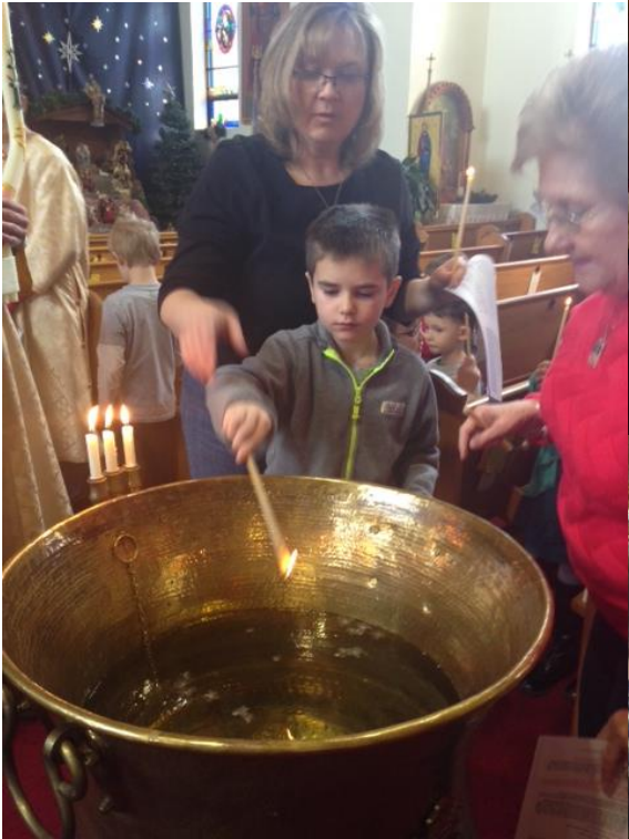
Theophany for children of "Ridna Shkola"