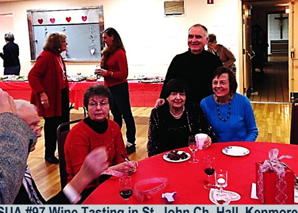
SUA #97 Wine Tasting in St. John Ch. Hall, Kenmore пов'яякуємо! please submit them to us for future use. Thanks!