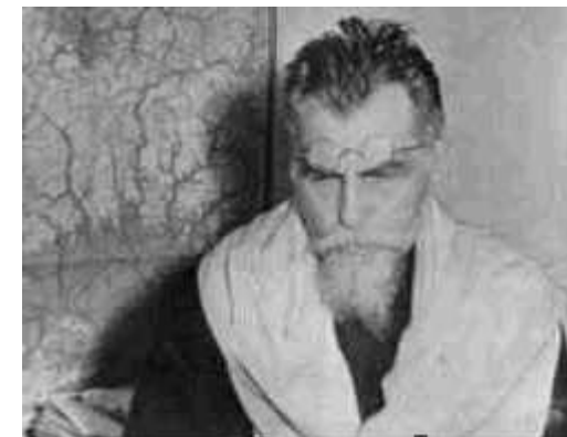
Patriarch Joseph in prison