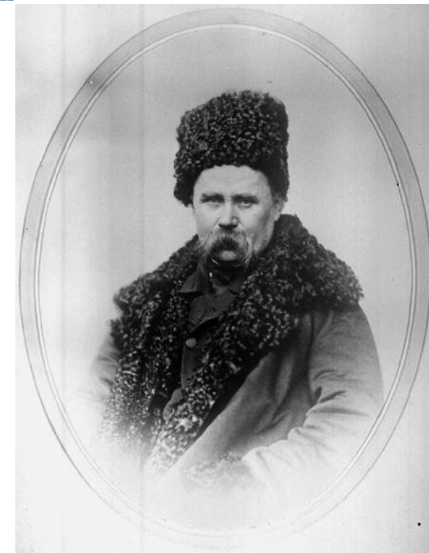
Taras Shevchenko -1859- Тарас Г. Шевченко

CHURCH BULLETIN - N°11 March 11 - 2012 - 11 Березня ЦЕРКОВНИЙ ВІСНИК - Ч. 11