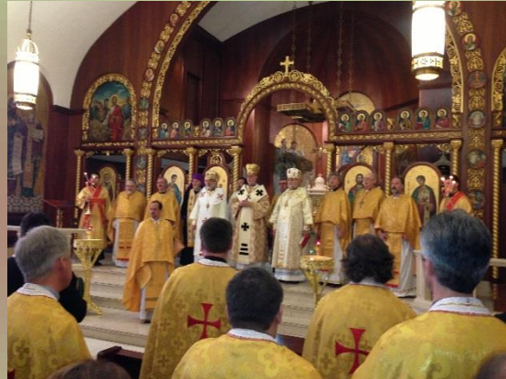
Divine Liturgy in the Chapel