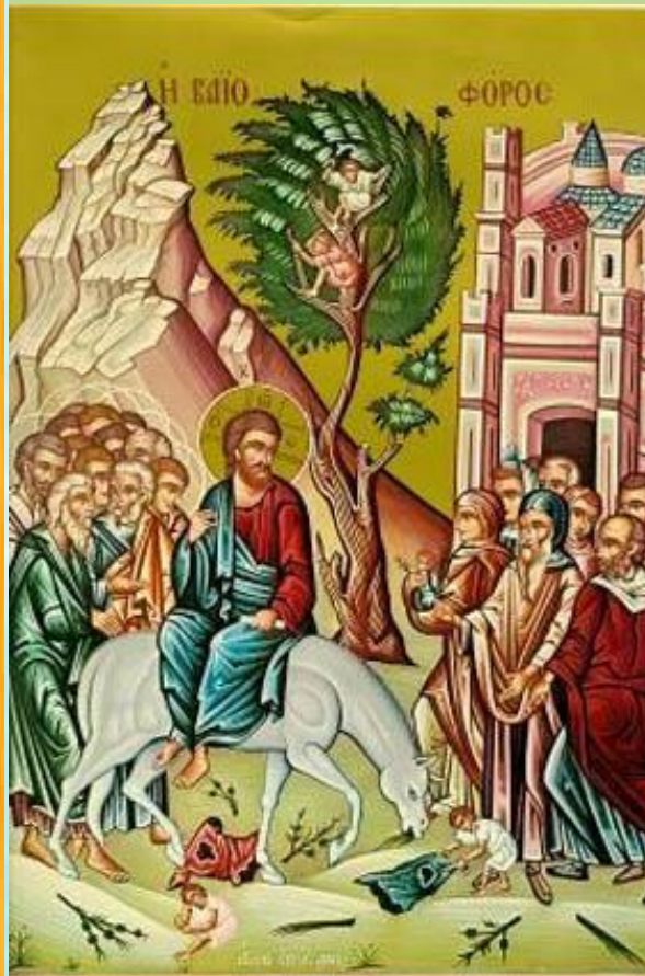
Entry into Jerusalem - Квітня Неділя

April 28 - 2013 - 28 Квітня ЦЕРКОВНИЙ ВІСНИК