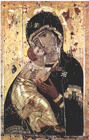
Mother of God from Vyshhorod

From the concert I Ukrainiann Home "Dnipro", April 29, 2017 Concert was indeed very nice. Thanks to all participants and organizers. Mnohaya Lita!