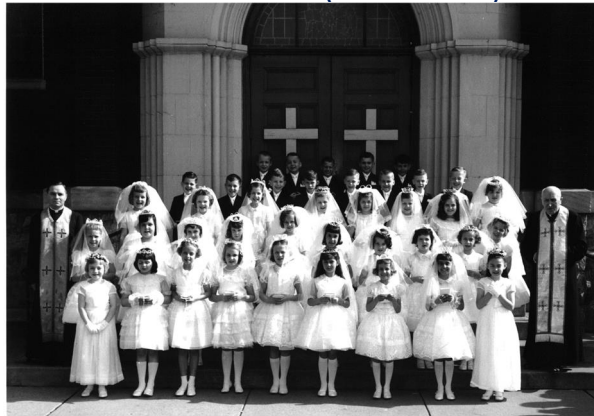
From Last Bulletin: (Photo No. 14)