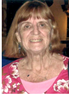
(May 20, 1934 – May 6, 2012)