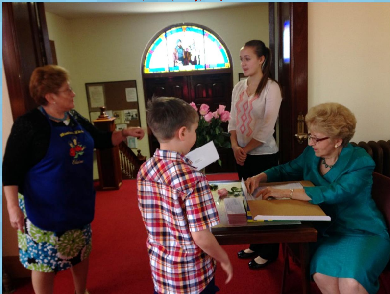
Ready to give roses on Mother's Day to all mothers