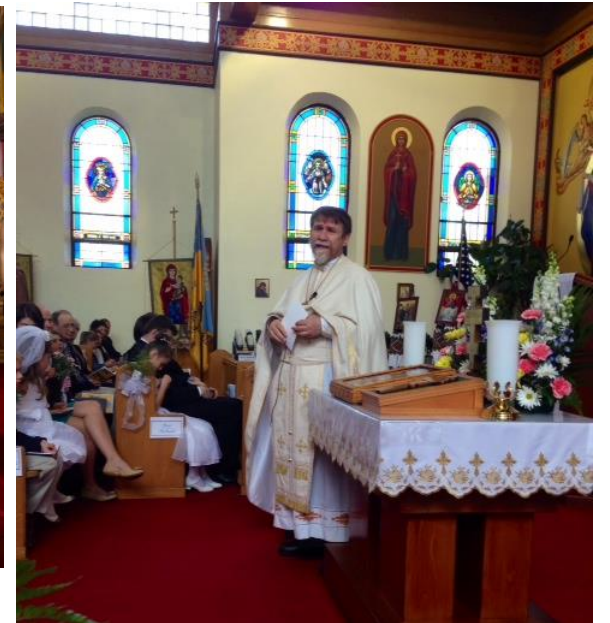
Solemn Holy Communion – Торжественне Св. Причастія