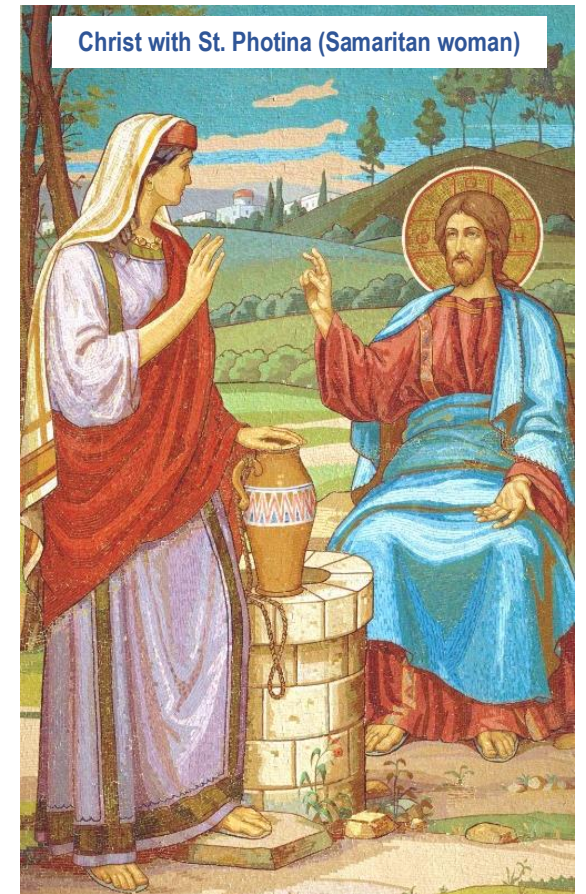
Христос розмовляє зі Самарянкою