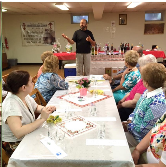
Vine tasting, St. Mary, Niagara Falls, May 29, The icon at Buszka Funeral Home