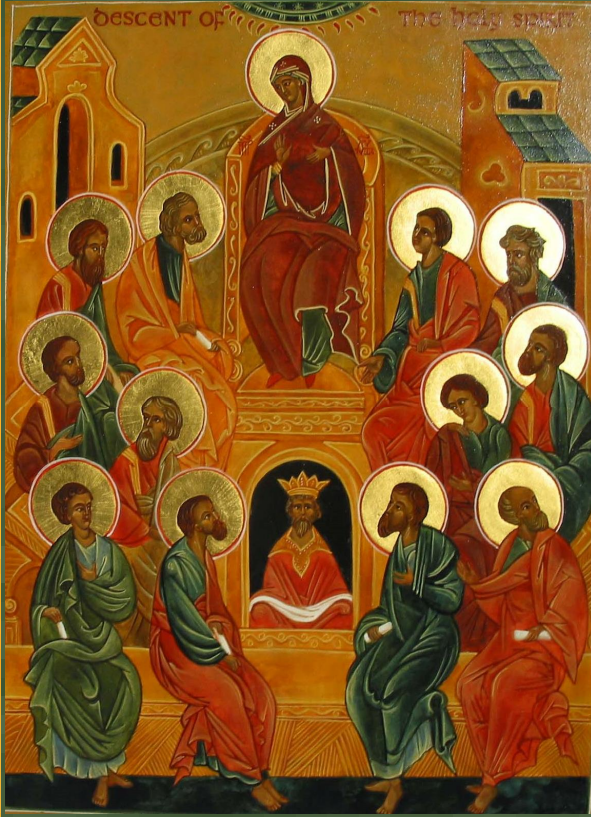
Discent of the Holy Spirit (Pentecost) Зіслання Святого Духа (Зелені Свята)

Царю Небесний, Утішителю, Душе Істини, прийди і вселися в нас... і очисти нас від всякої скверни, і спаси, Благий, душі наші!