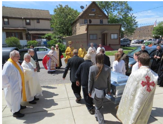
Eternal Memory – Вічна Пам'ять!