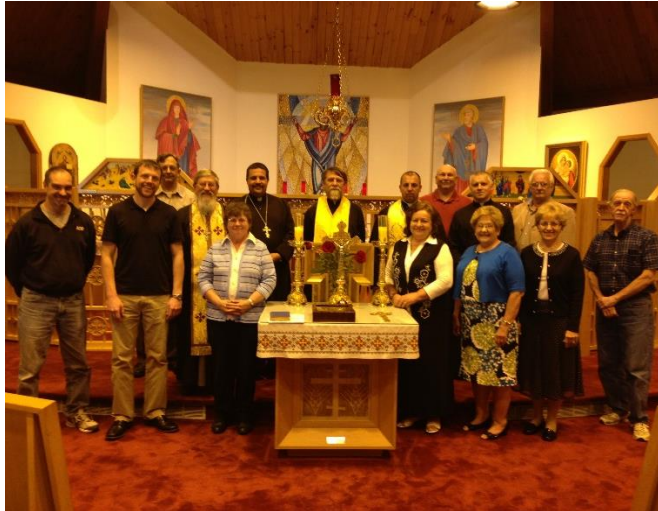
Swearing of the deanery trustees in St. John, Kenmore