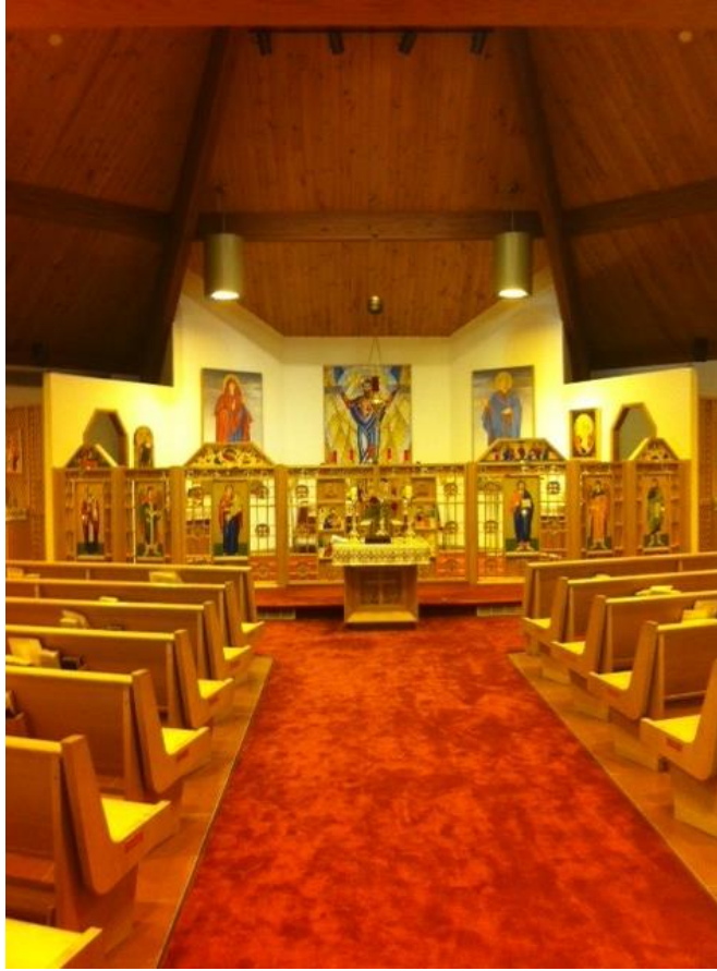
St. John the Baptist Ukr. Cath. Church, Kenmore