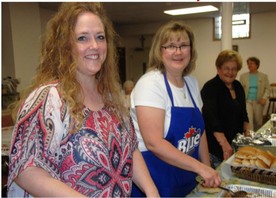
Father's Day Breakfast – June 15, 2014. Thank You!