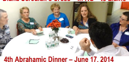
4th Abrahamic Dinner – June 17, 2014