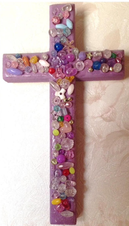
Diana Serediuk's Cross – in KG – to Elaine

3 нагоди 60-ліття ПОДРУЖЖЯ Многая Літа Пані Лідо і Пане Маркіяне!