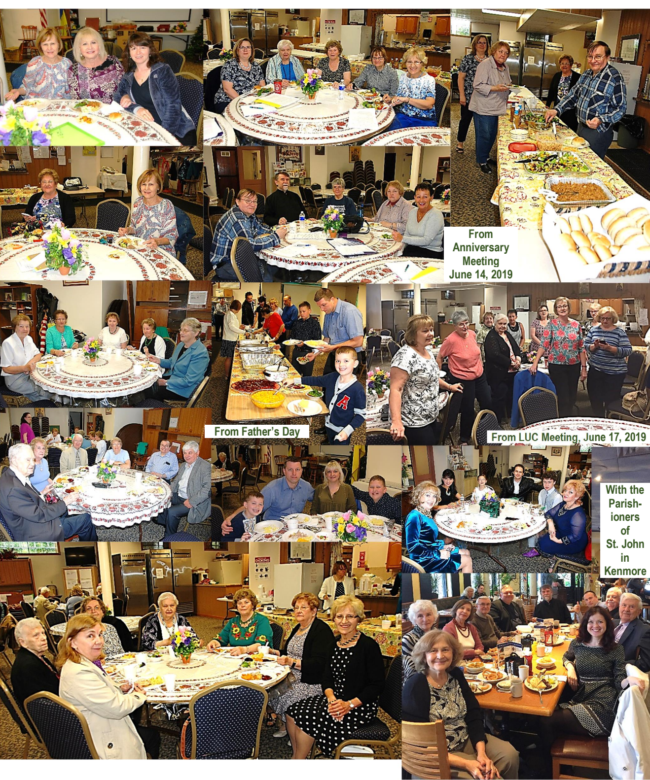
From Anniversary Meeting June 14, 2019