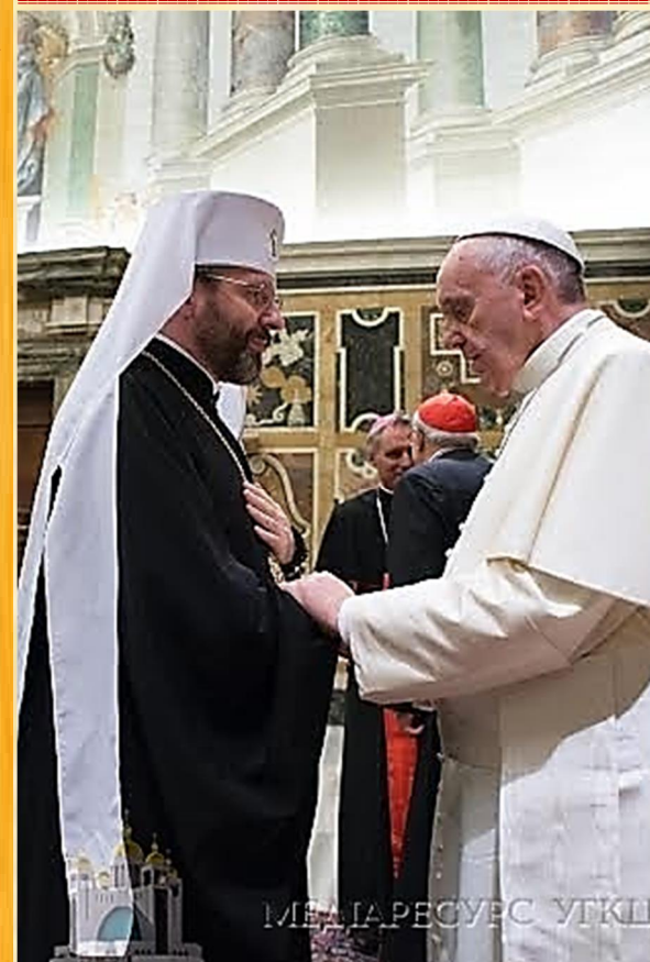
Глава УГКЦ розповів Святішому Отцеві про «біль українського народу»

Блаженніший Святослав мав нагоду особисто поспілкуватися зі Святішим Отцем, він розповів йому про ситуацію в Україні, тисячі біженців та сотні поранених і вбитих. За його словами, Папа Франциск запевнив, що молитися за Україну і робить все можливе, щоб у нашій країні запанував мир і спокій. Святіший Отець також особисто привітав Главу УГКЦ із ювілеєм 20-річчя священничого служіння, який випадає в цей день.