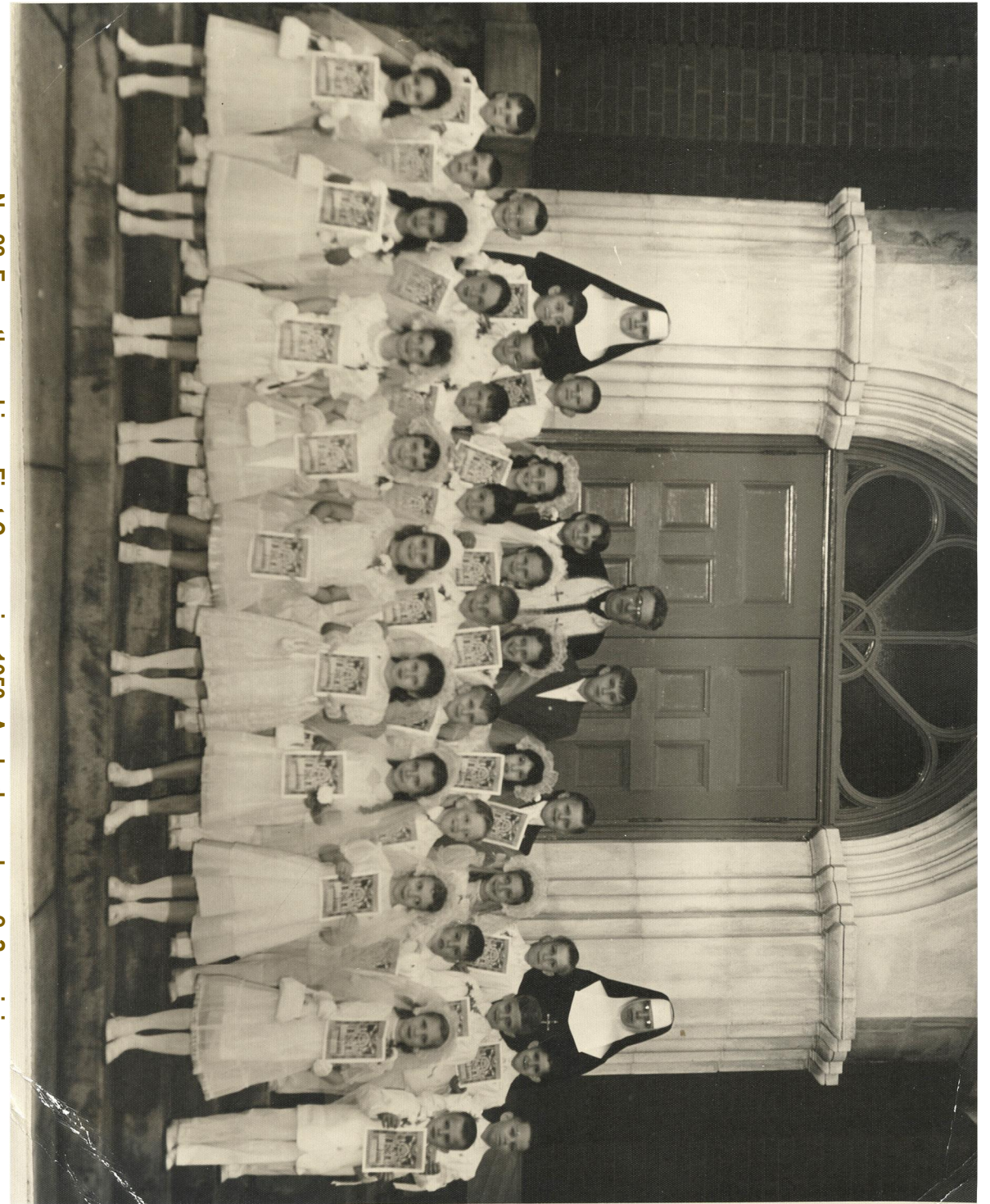
No. 22. From the archives: First Communion 1953. Anybody you know? 3 apxibib.