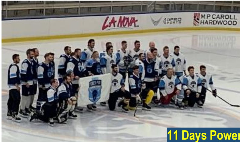
11 Days Power Play