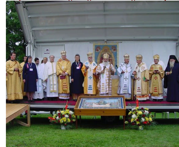
Holy Dormition Pilgrimage - Sloatsburg 2004 - Проца