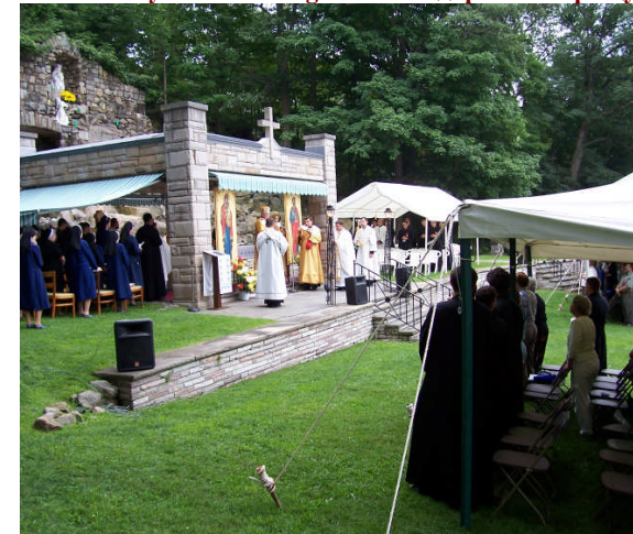
Holy Dormition Pilgrimage - Sloatsburg 2004 - Проца