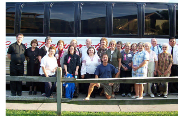
On the way to Sloatsburg 2004 – Подорож на Процу