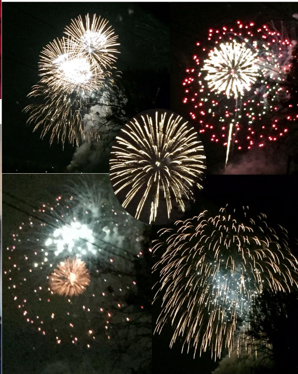
4 th of July fireworks