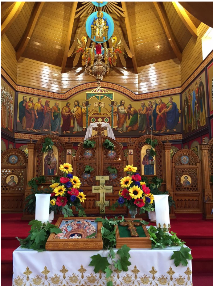
St. Nicholas Ukrainian Catholic Church - Pentecost