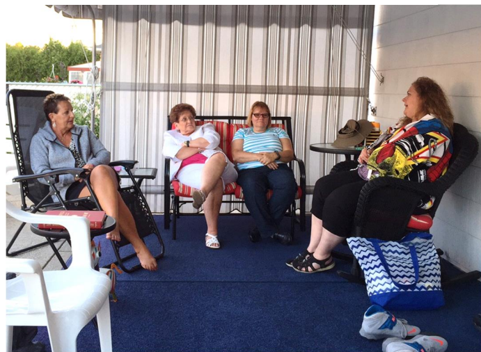
Relaxing at Lepkyj's Residence in Cheektowaga