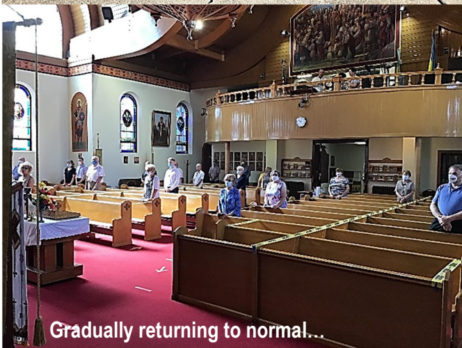
Gradually returning to normal...