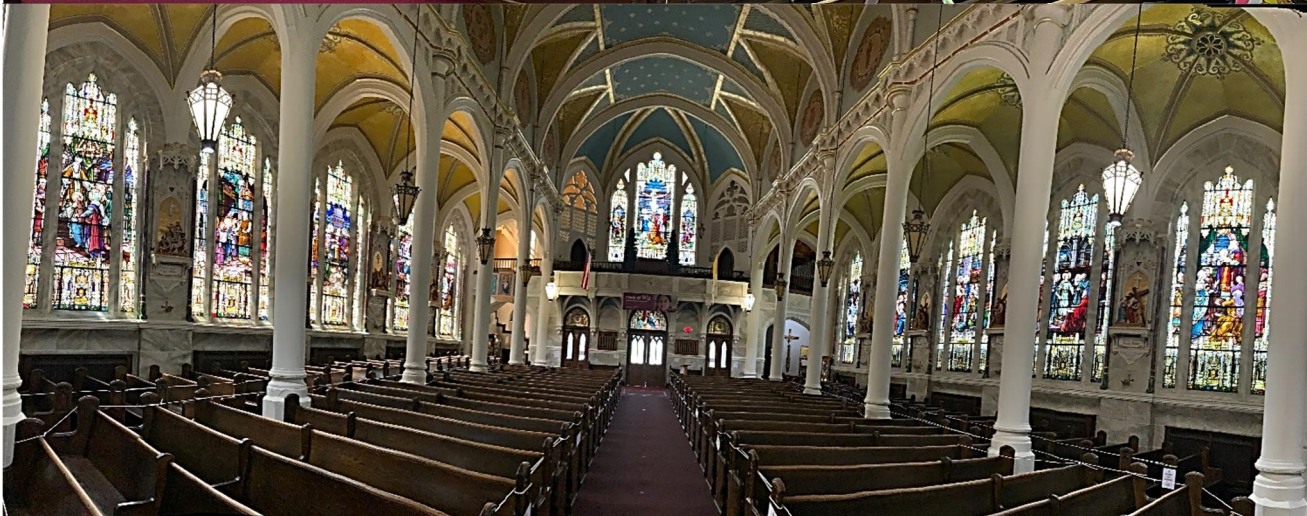
Visit to Minor Basilica of St. Mary of the Angels, 202 S. Union St., Olean, NY. 1913. Windows from 1919.

SAINT NICHOLAS UKRAINIAN CATHOLIC CHURCH