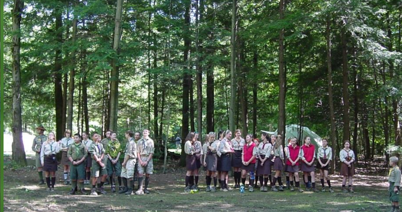
Plast Camp at Novyj Sokil / На пластовому Таборі