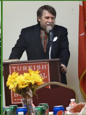
At Turkish Cultural Center