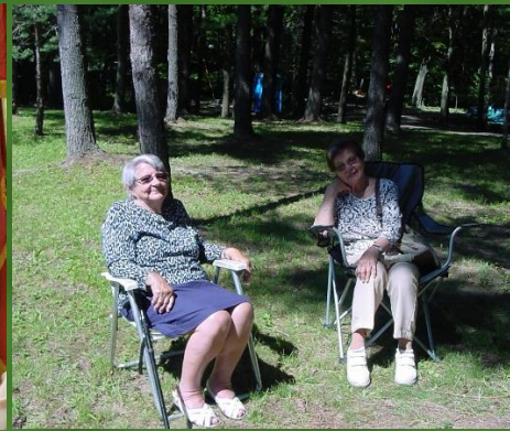
At Plast Camp / Відпочинок на Соколі