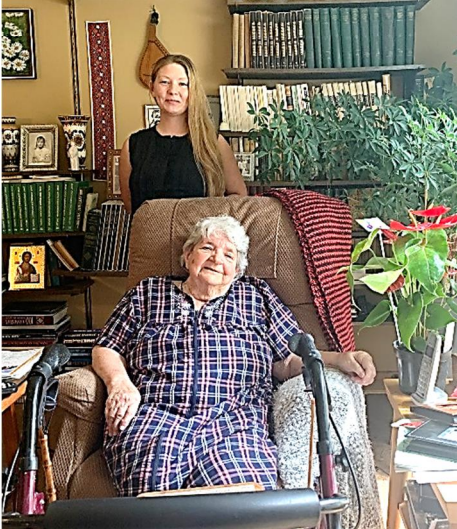
Happy Birthday! Многая Літа, Пані Олю!