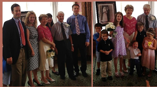
МНОГАЯ ЛІТА - НА МНОГАЯ І БЛАГАЯ ЛІТА!