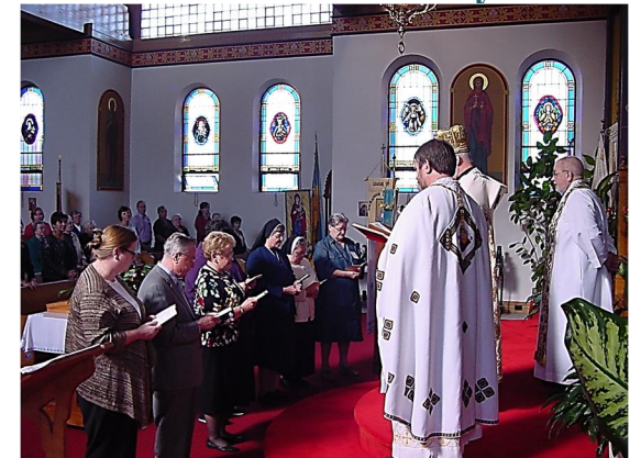
LUC Convention 2011 – Конвенція Ліги 2011

We ask the support of our local Ukrainian community in this endeavor. We especially ask that organizations not schedule any events that weekend. Thank you!