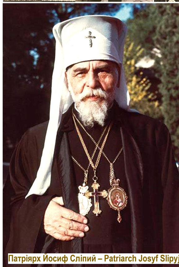
Патріярх Йосиф Сліпий – Patriarch Josyf Slipyi

Прийми Господи, молитви наші за Св. Пам. Патріярха Йосифа, якого Ти нам у своїй доброті був післав. Помози нам, Господи, працювати для збереження нашої рідної церкви, для якої все життя невтомно трудився Патріярх Йосиф, та якої права так відважно і віддано обороняв.