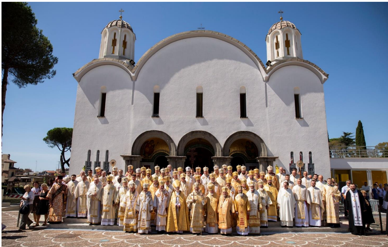
St. Sophia in Rome during the Synod of our Church – Св. Софія в Римі підчас Синоду нашої Церкви