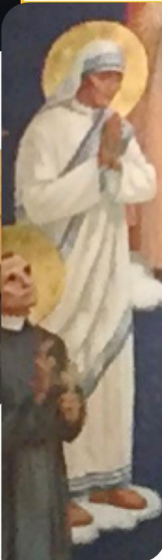
Blessed Mother Teresa of Calcuta was proclaimed saint on the September 4. This photo is from the church of St. Paul in Columbus, OH taken by me on the day of proclamation.