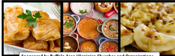
Sponsored by Buffalo Area Ukrainian Churches and Organizations

www.UkrainiansofBuffalo.com Make checks payable to: Aid for Ukraine UFCU Account # 1101037710 c/o Ukrainian Federal Credit Union 562 Genesee St. Buffalo, NY 14204 www.PayPal.com/fundraiser/charity/1438034