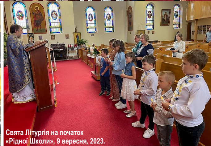
Свята Літургія на початок «Рідної Школи», 9 вересня, 2023.