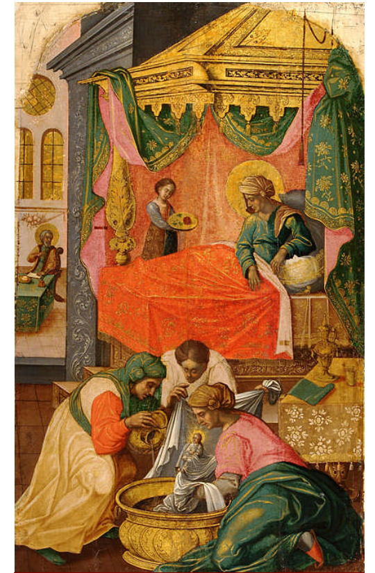
Народж. Богородиці Київ-Печ. Лавра