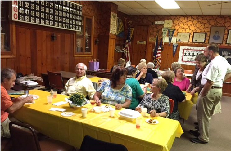
Sitch Dinner, September 27, 2015