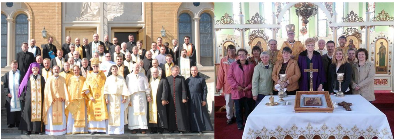
Clergy Days, October 6-8