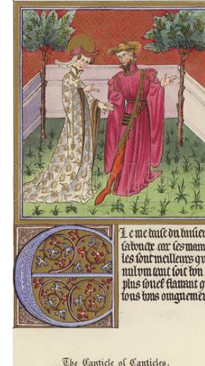
The Canticle of Canticles.

This belief and faith we have in our God, and the coming of our Lord and Savior Jesus Christ to us is the fulfillment of the love story of the "Canticle of Canticles." It is THE beginning of the greatest love story ever told! Our God loves us, each and every one of us, made in His image and likeness! Yes! Our God loves us! How