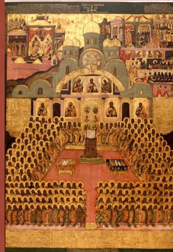
Отці VII Собору – Fathers of VII Council ← Христос Цар Всесвіту – Christ the King