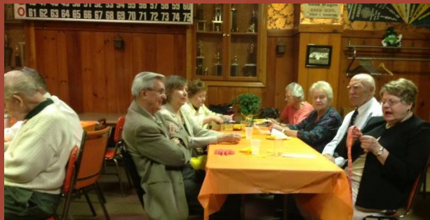
Sitch Dinner, September 29, 2013