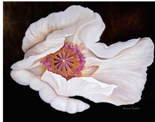
"White Poppy" Oil on Canvas, 40" x 52", © Dianna Derhak, All Rights Reserved.