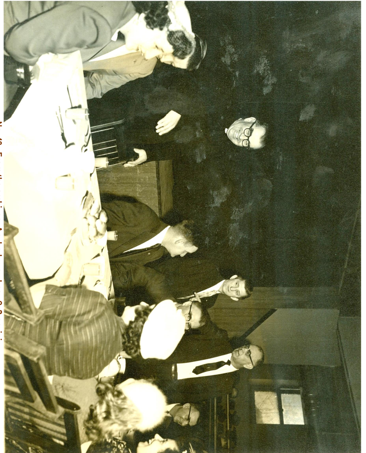
No. 48. From the archives: Anybody you know? 3 appixib.